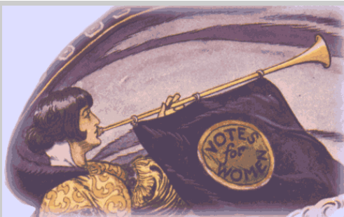
90 Years of Equality and Freedom by Jan Larimer, RNC Co-Chairman

"The right of citizens of the United States to vote shall not be denied or abridged by the United States or by any State on account of sex. Congress shall have power to enforce this article by appropriate legislation."