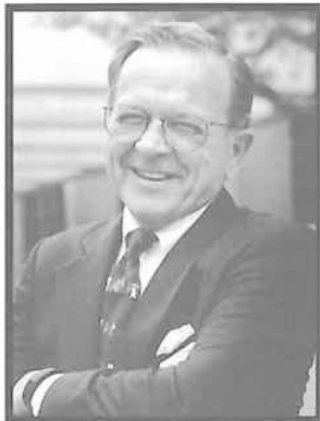
SENATOR TED STEVENS 1923-2010

"My future is in God's hands. The future of Alaska, however, is in your hands."