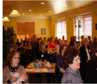
Members listening intently to Gov Palin addressing the VRWC March 21st meeting.