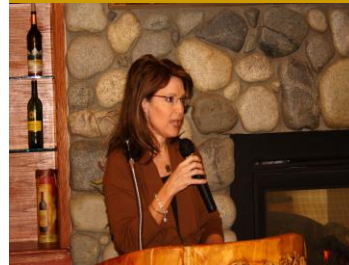
Governor Sarah Palin speaking at VRWC's March 21st meeting